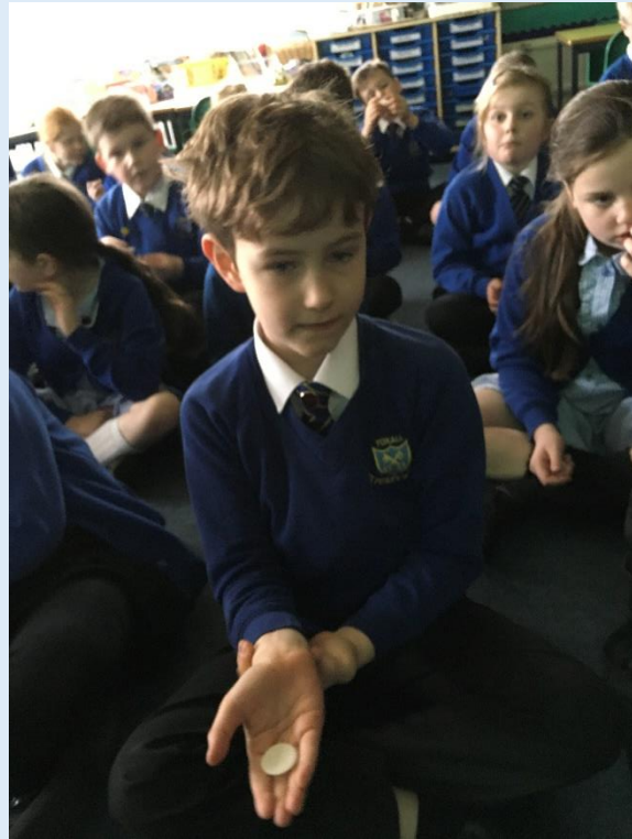
The children examine the items behind the ritual of Communion close up.